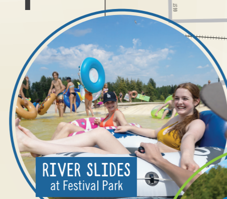
RIVER SLIDES at Festival Park