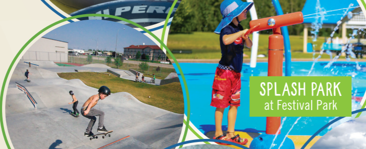
SPLASH PARK at Festival Park