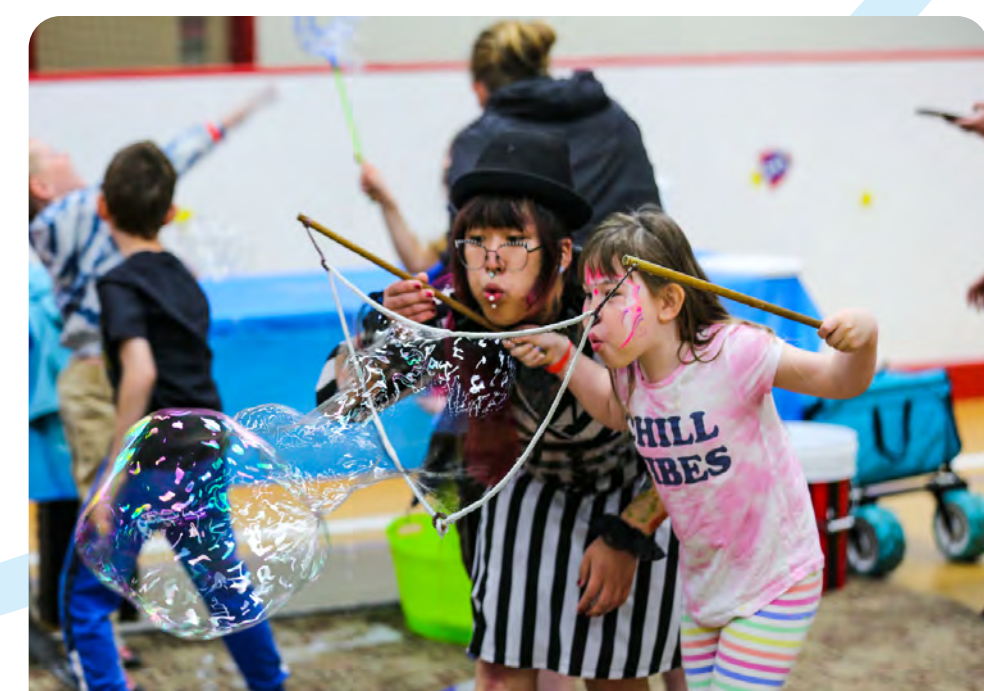
Tim Hortons Community Fun Nights