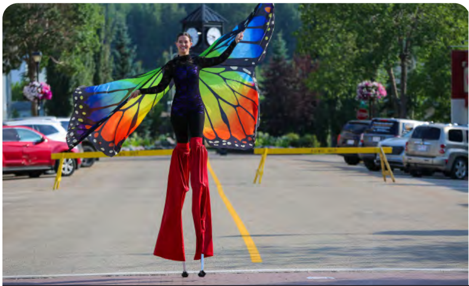
Summer Street Fest