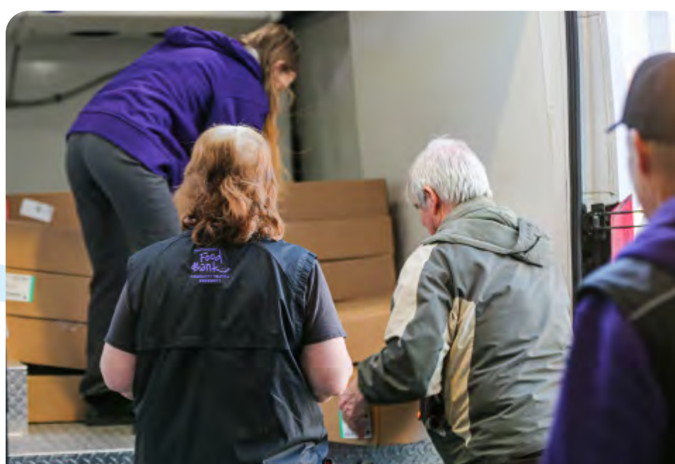
National Volunteer Appreciation